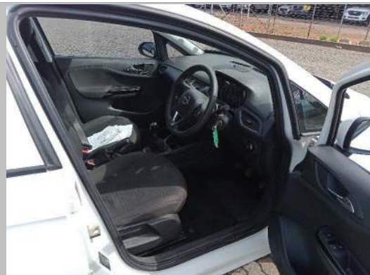
INTERIOR (FRONT DRIVER DOOR)