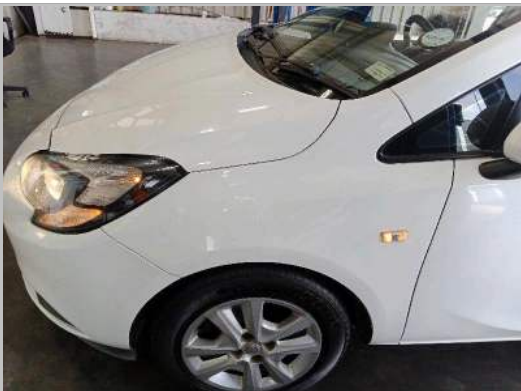
Front Fender Left