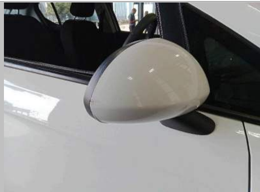
Side Mirror Right