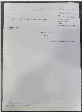
Diagnostic report page 6