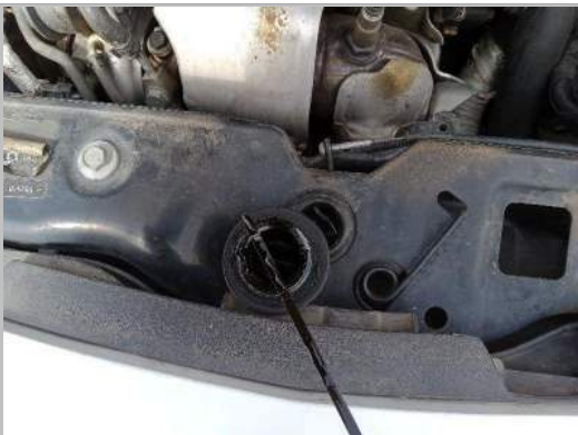
Oil cap and dipstick