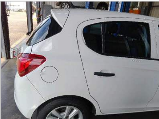
Rear Fender Right