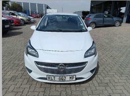
90 DEGREE FRONT