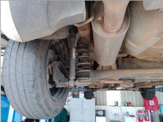
LR TYRE TREAD