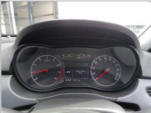
DASHBOARD (W/ ENGINE RUNNING)