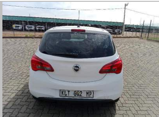
90 DEGREE REAR