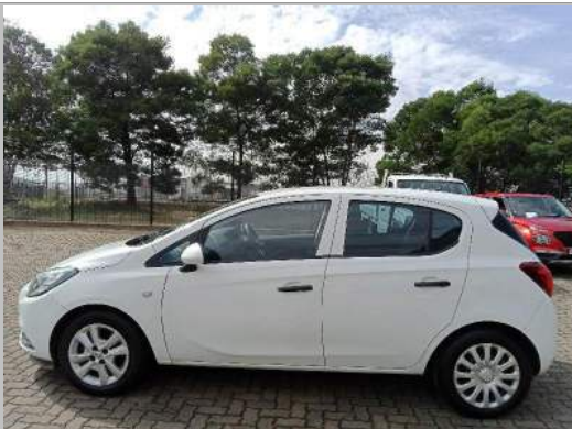
90 DEGREE LEFT