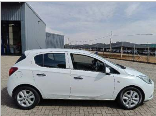
90 DEGREE RIGHT