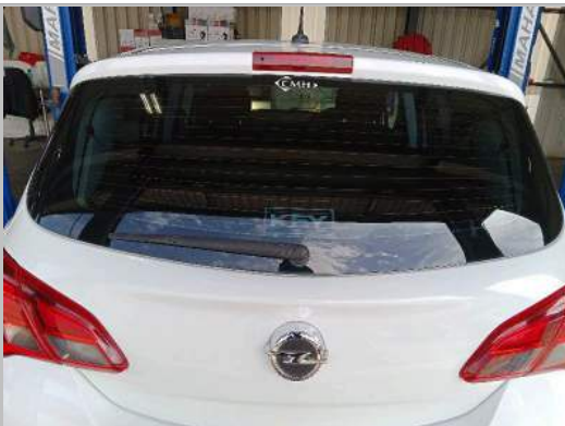
Boot Lid / Hatch door