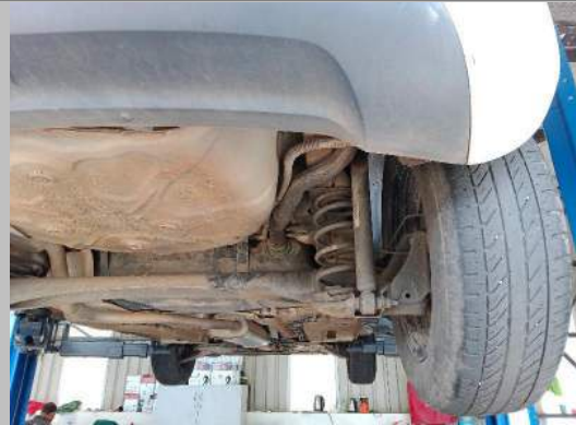
RR TYRE TREAD