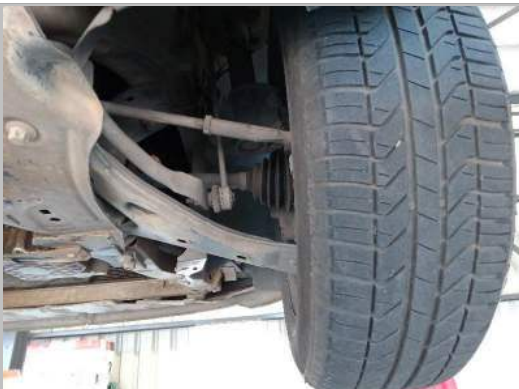
RF TYRE TREAD