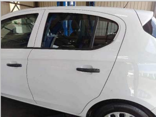
Door Rear Left