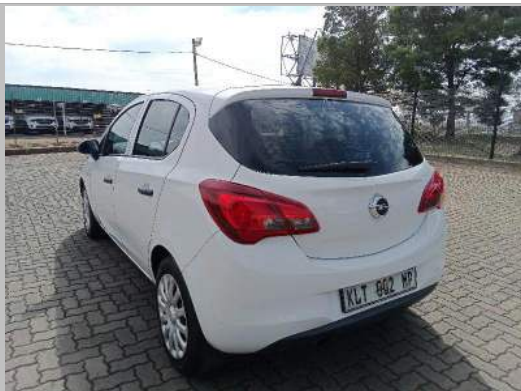
REAR LEFT CORNER