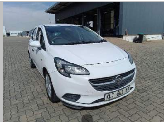
FRONT RIGHT CORNER