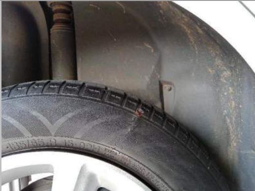
Tyre Rear Right