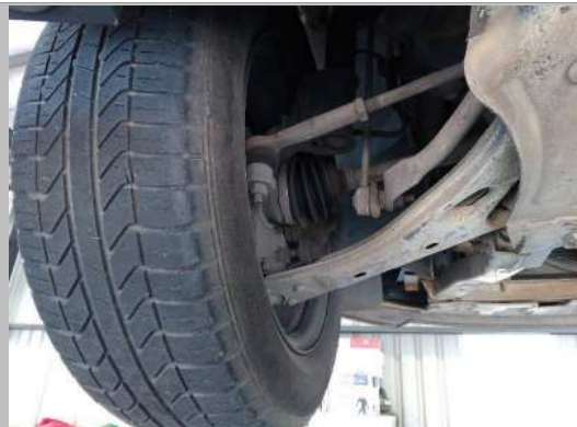
LF TYRE TREAD