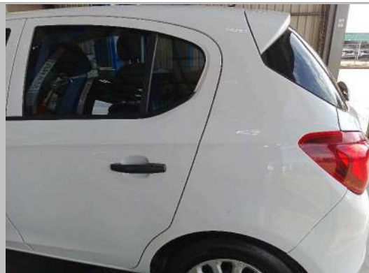
Rear Fender Left