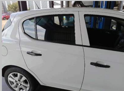
Door Rear Right