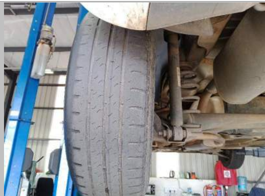
Tyre Rear Left