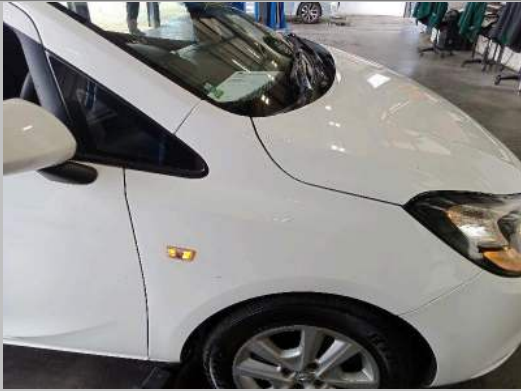
Front Fender Right