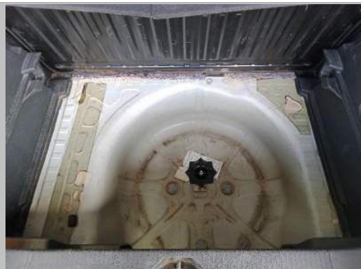
Inner Boot Floor Pan and Spare Wheel Well