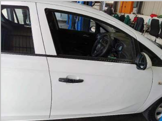
Door Front Right