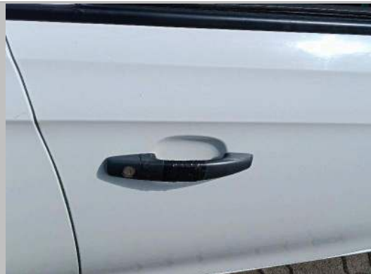
Door Handle Front Right