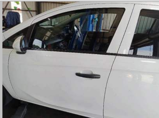
Door Front Left