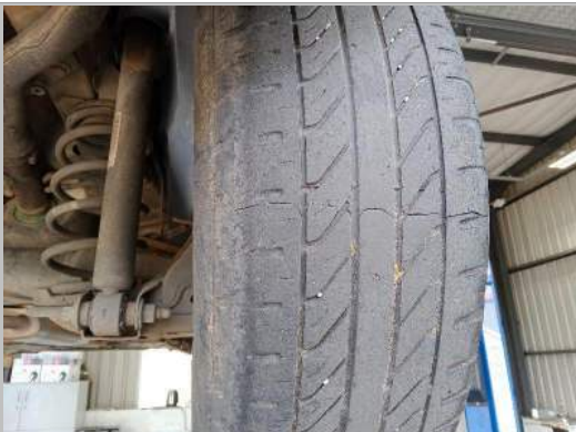
Tyre Rear Right