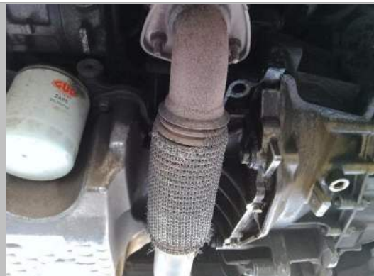
Engine to silencer pipe