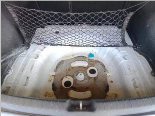
Inner Boot Floor Pan and Spare Wheel Well