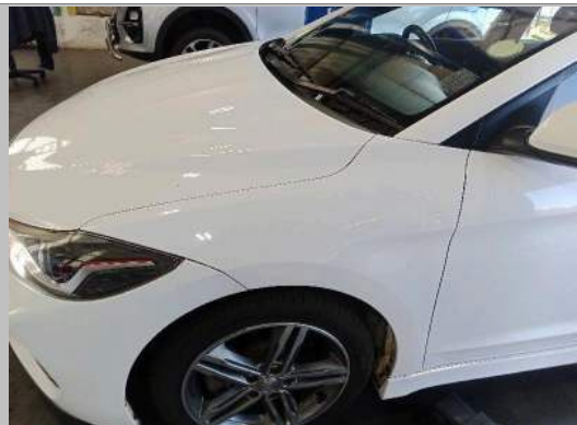
Front Fender Left