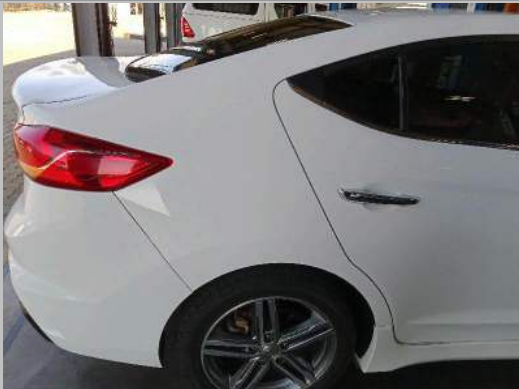
Rear Fender Right