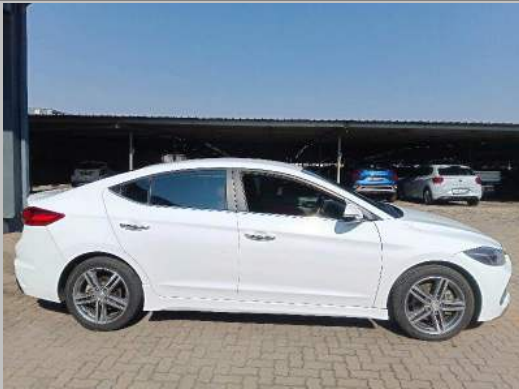
90 DEGREE RIGHT