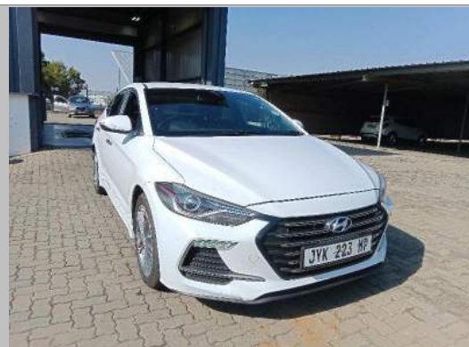
FRONT RIGHT CORNER