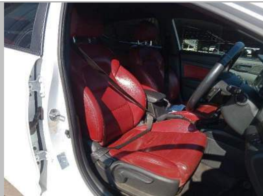
Seat Front Right