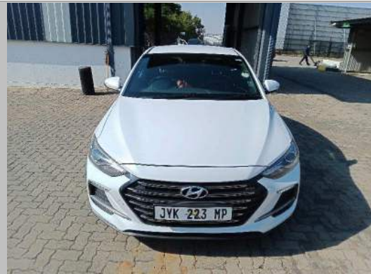
90 DEGREE FRONT