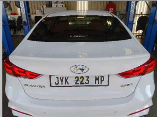
Boot Lid / Hatch door