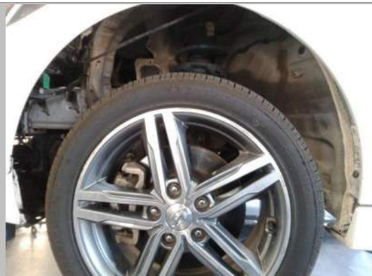
Front Fender Left / Inner Tray