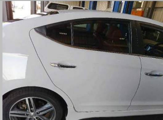
Door Rear Right