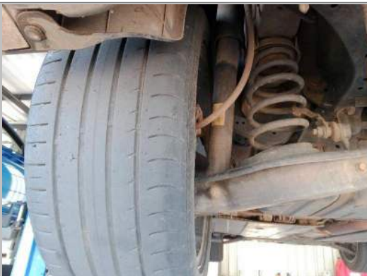
Tyre Rear Left