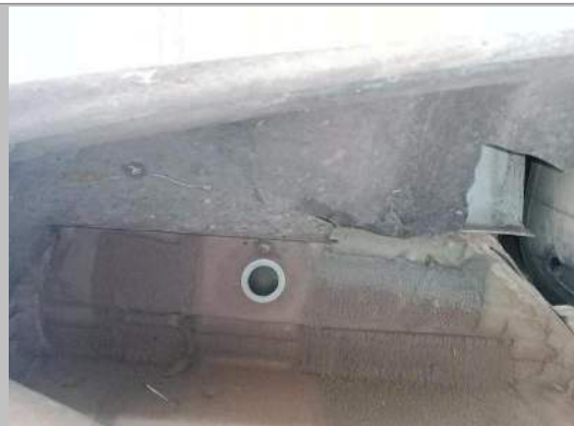
Rear Fender Right / Inner Tray