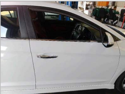
Door Front Right