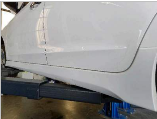
Sill Panel Left