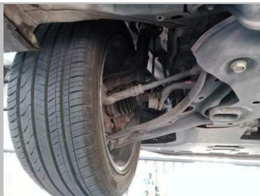
LF TYRE TREAD