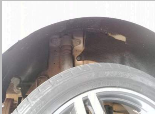
Rear Fender Right / Inner Tray