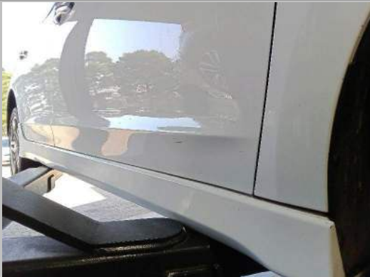
Sill Panel Right