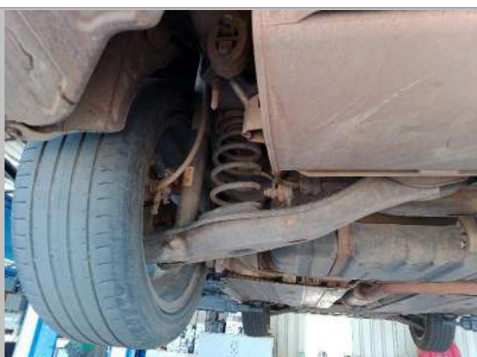
LR TYRE TREAD