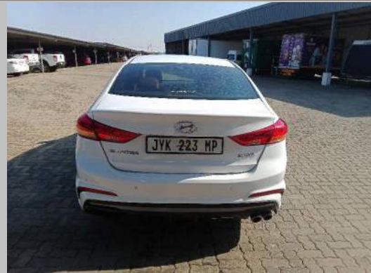
90 DEGREE REAR