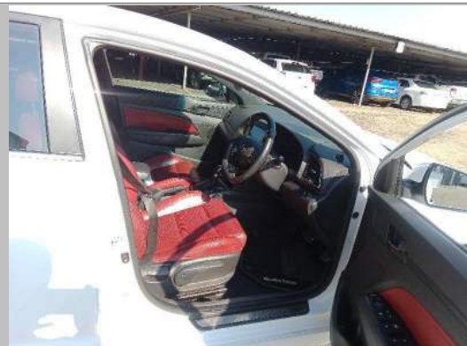
INTERIOR (FRONT DRIVER DOOR)