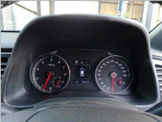
DASHBOARD (W/ ENGINE RUNNING)