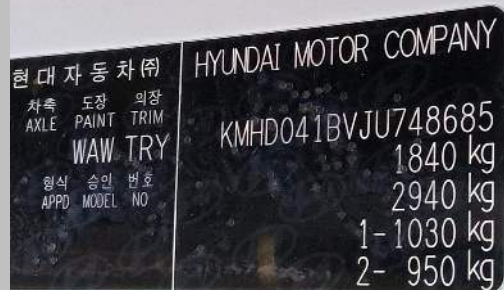
VIN PLATE OR STICKER