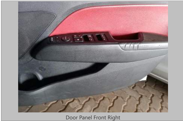
Door Panel Front Right

DEKRA Automotive (PTY) Ltd. 97 Willem Cruywagen Ave Klerksoord, Pretoria, 0200 Phone: 012 542 4867 www.dekraauto.co.za