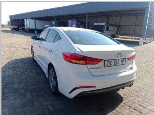
REAR LEFT CORNER