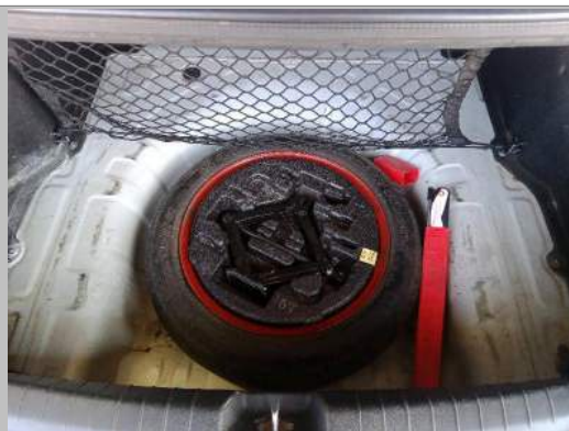
Spare wheel and Accessories