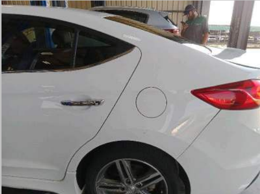
Rear Fender Left