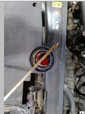
Oil cap and dipstick