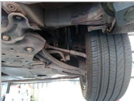
RF TYRE TREAD