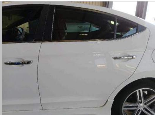
Door Rear Left