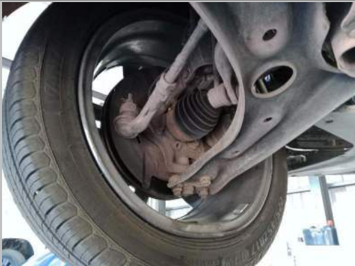
Rim Front Left