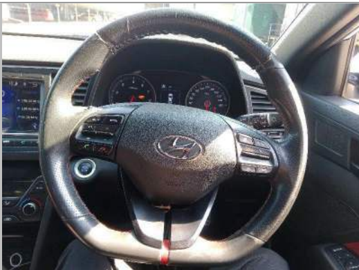
Steering Wheel Trim