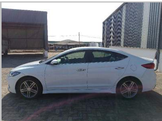
90 DEGREE LEFT