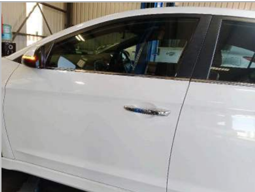
Door Front Left