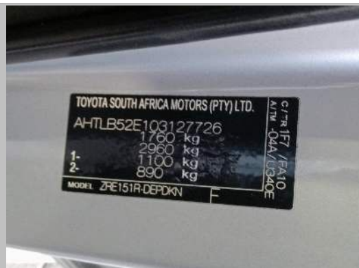
VIN PLATE OR STICKER