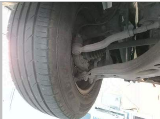
LF TYRE TREAD