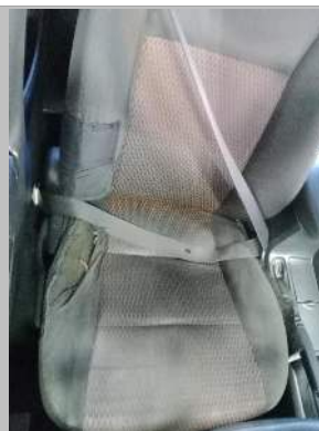
Seat Front Right