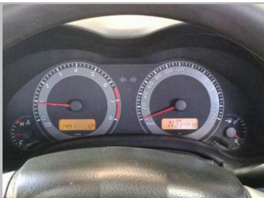
DASHBOARD (W/ ENGINE RUNNING)