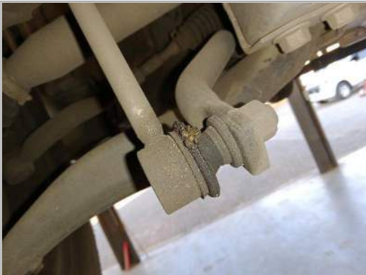
Stabilizer Mounting Front Right

DEKRA Automotive (PTY) Ltd. 97 Willem Cruywagen Ave Klerksoord, Pretoria, 0200 Phone: 012 542 4867 www.dekraauto.co.za