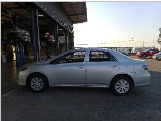
90 DEGREE LEFT