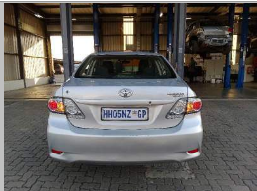
90 DEGREE REAR