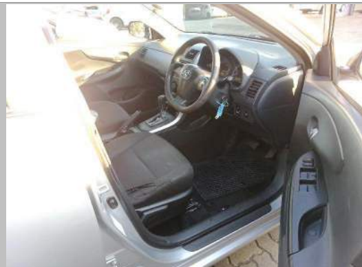
INTERIOR (FRONT DRIVER DOOR)