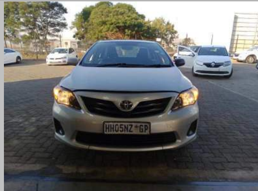
90 DEGREE FRONT