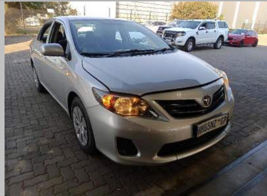
FRONT RIGHT CORNER