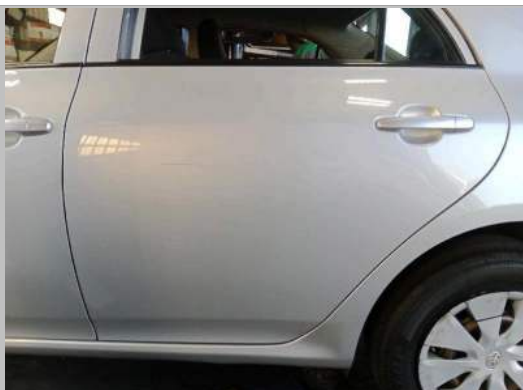
Door Rear Left