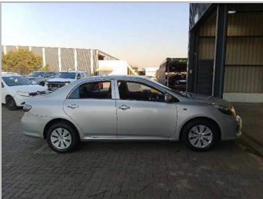
90 DEGREE RIGHT