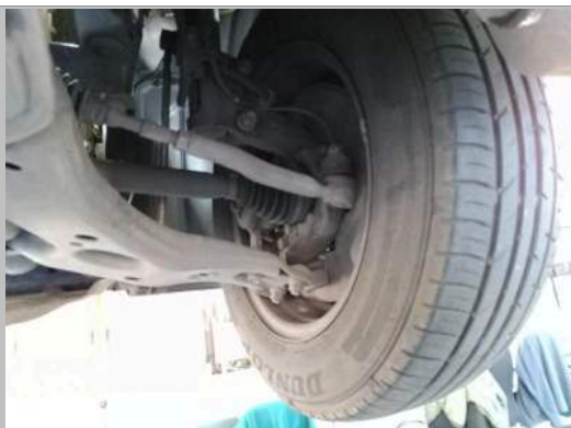
RF TYRE TREAD