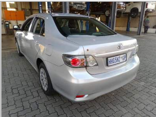
REAR LEFT CORNER