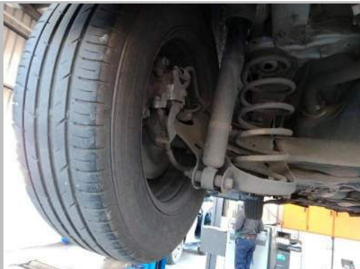
LR TYRE TREAD