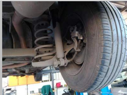
RR TYRE TREAD