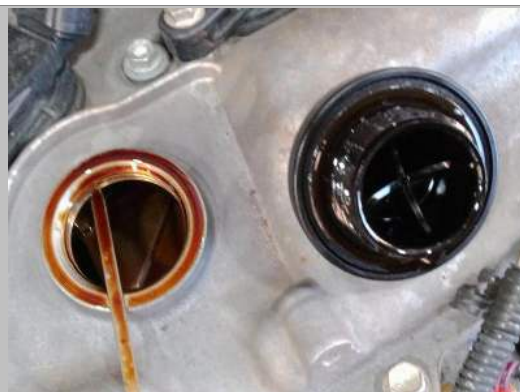
Oil cap and dipstick